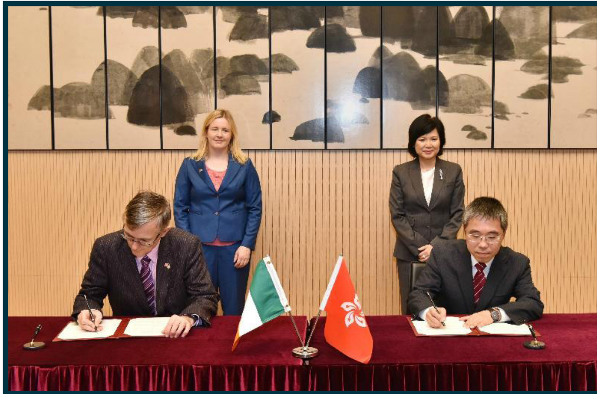
MoU signing ceremony between QQI and EDB on 23 September 2016

The EDB and the QQI signed a Memorandum of Understanding (MoU) in September 2016 for the purpose of strengthening collaboration in the development of their qualifications frameworks, promoting mutual recognition of qualifications and facilitating the mobility of learners and employees between Ireland and Hong Kong.